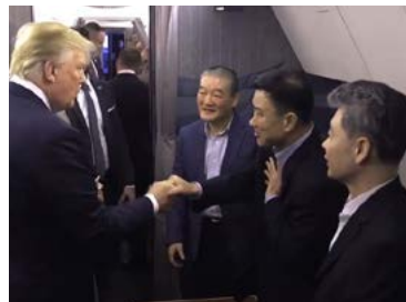
Donald Trump meets the released prisoners.