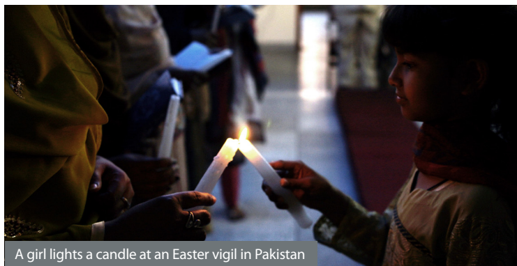
A girl lights a candle at an Easter vigil in Pakistan