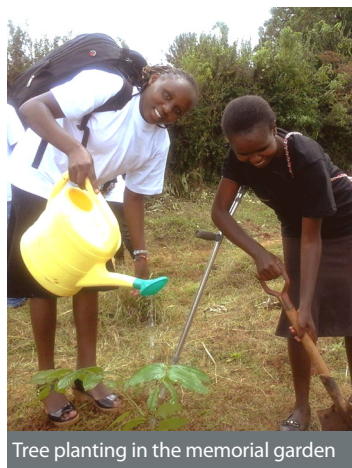
Tree planting in the memorial garden

A memorial garden has been planted in Eldoret, with a tree planted in memory of each victim. One survivor, Everlyne, planted a tree in the garden, despite the fact she is