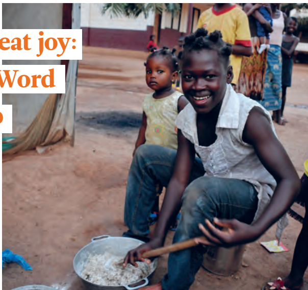
A camp for internally displaced persons in Central African Republic

When life gets difficult, it can be easy to take comfort from the things around us: our homes, our relationships, our possessions – all good things. But where do we turn when those things are taken from us? From where do we draw our strength?