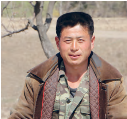
Illustrative image used

Despite the intense food shortages in North Korea, believers there follow the practice of ‘Holy Rice’, whereby some of the rice they receive is set apart for use in God’s kingdom. This means they are able to help others in their community, which in turn leads to trust and opportunities to share the gospel.