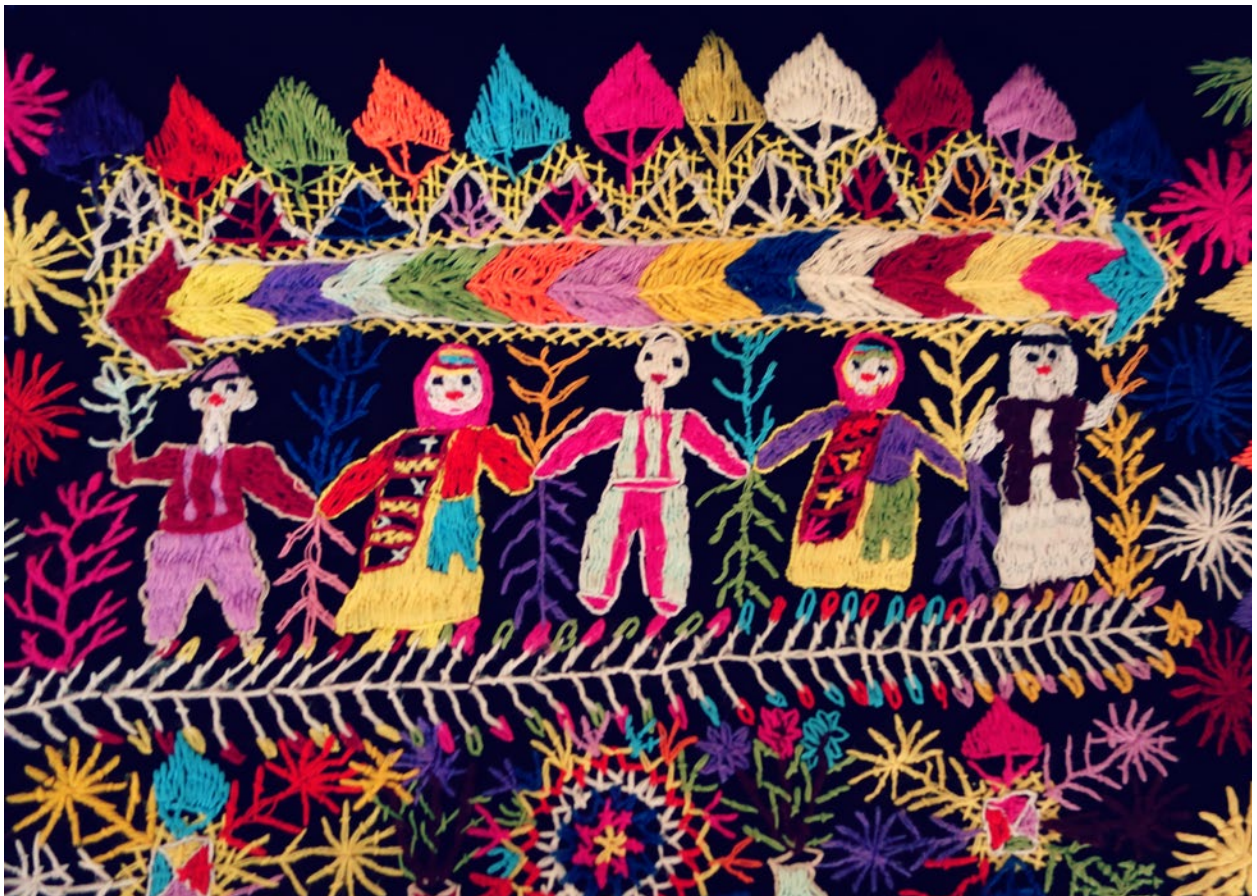
A traditional Iraqi embroidery of people in national dress, made during vocational training for the internally displaced in Iraq

freedom for Christians do not always seem to materialise in reality.