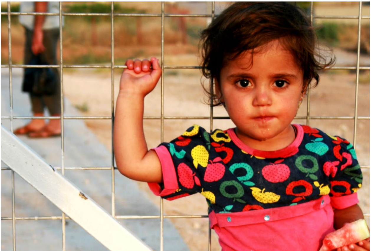
Child in a camp for the internally displaced in Iraq, close to the border of Syria

Christians make up a disproportionate number of Iraqi refugees. There were more than a quarter of a million registered Iraqi refugees in Syria during 2004-2010. Of these, 44 per cent were Christian.