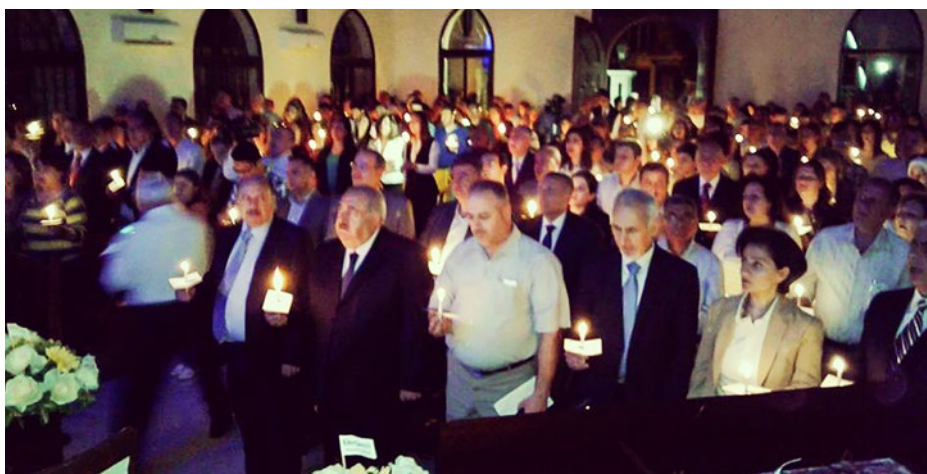
Christians gather in Aleppo for an interdenominational prayer meeting to mark a global day of prayer for the city, May 2016

We invite every reader of this document to do what they can to turn this vision into a reality. To light a candle in the darkness. To bring hope for the Middle East.