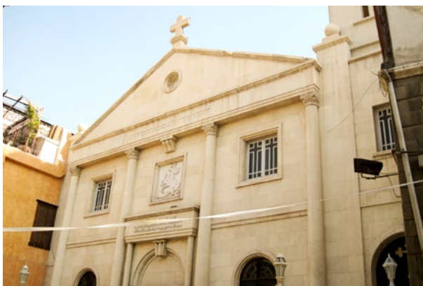
Church in the old city of Damascus, built where the house of Ananias is alleged to have been, where the apostle Paul stayed after being blinded on the road to Damascus

Ancient Syria was a heartland of Christianity for 700 years and modern-day Syria has its roots in what was the Eastern Roman empire,