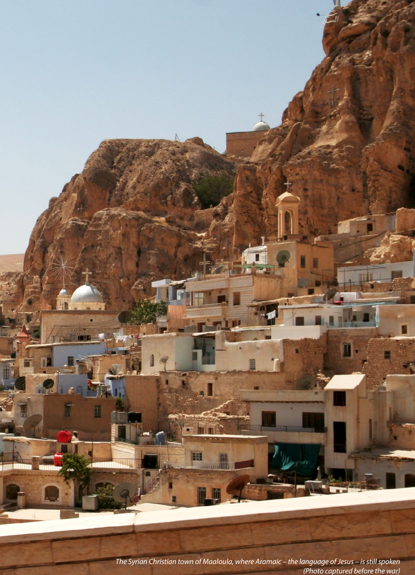
The Syrian Christian town of Maaloula, where Aramaic – the language of Jesus – is still spoken (Photo captured before the war)