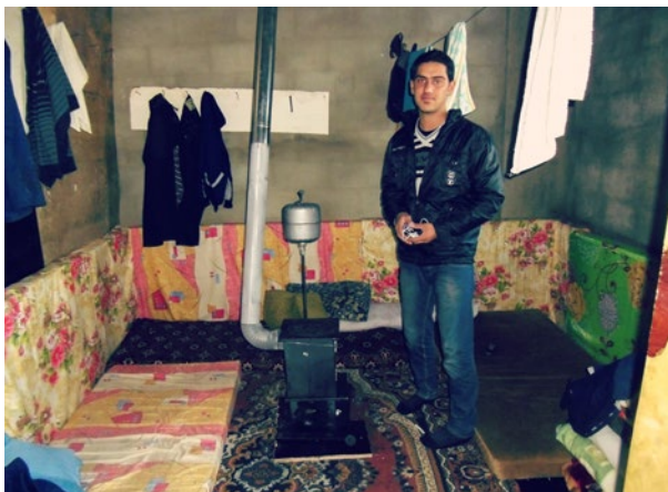
A Syrian man in his home, standing by a stove that was provided through a local church

Christians in both Syria and Iraq have distinguished themselves in the realms of social affairs and services. During the current crisis, Christians have played a significant role in providing humanitarian assistance through their churches and faith-based organisations (FBOs).