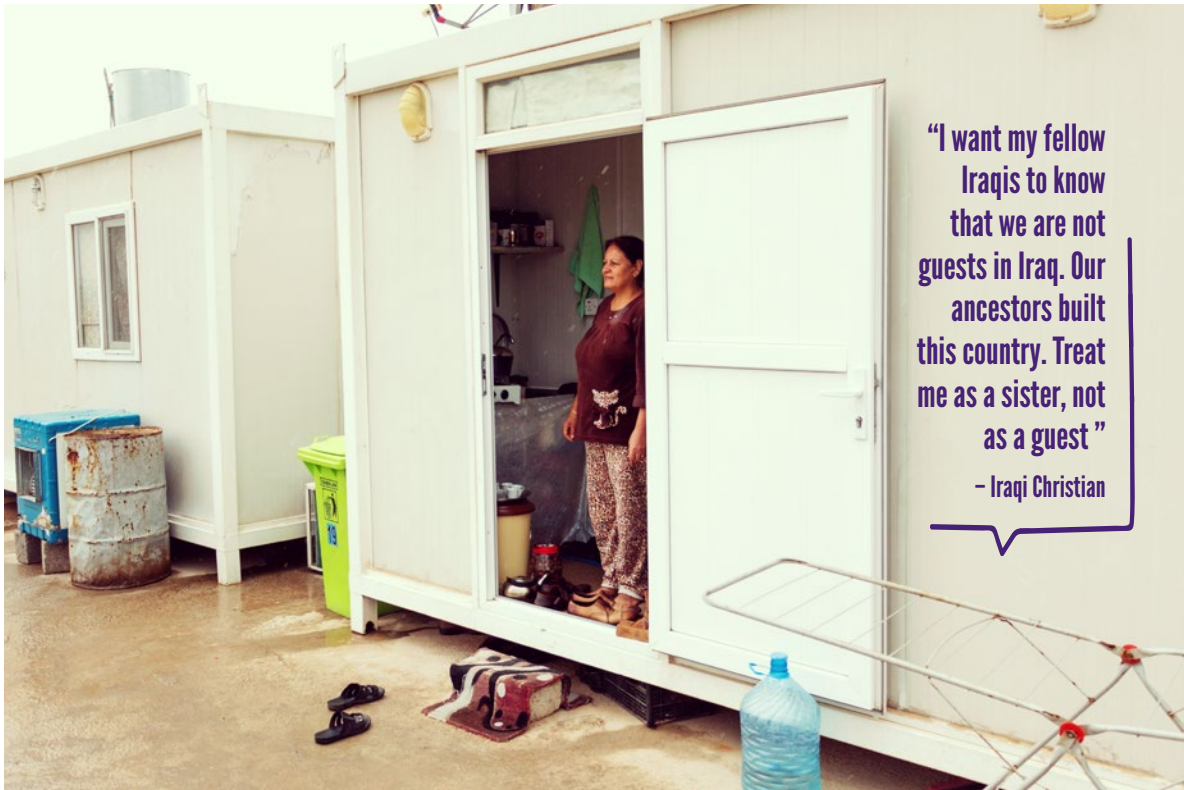
Christian woman in a camp for the internally displaced, near Dohuk, northern Iraq

were looking for the international community, the governments of Syria and Iraq, and all parties of the conflicts to: