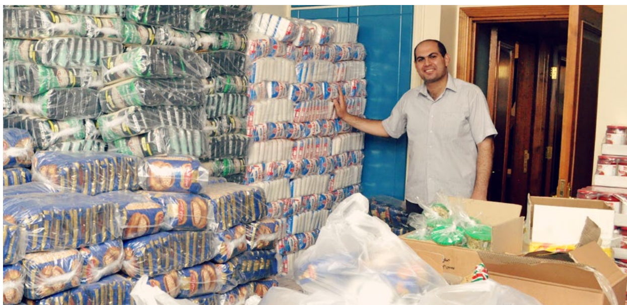
Rooms full of humanitarian aid for the internally displaced in Alliance Church, Damascus

Alongside church-based relief work, many Syrian Christians have also chosen to invest their energies as participants in the emerging non-religious humanitarian network in Syria. A