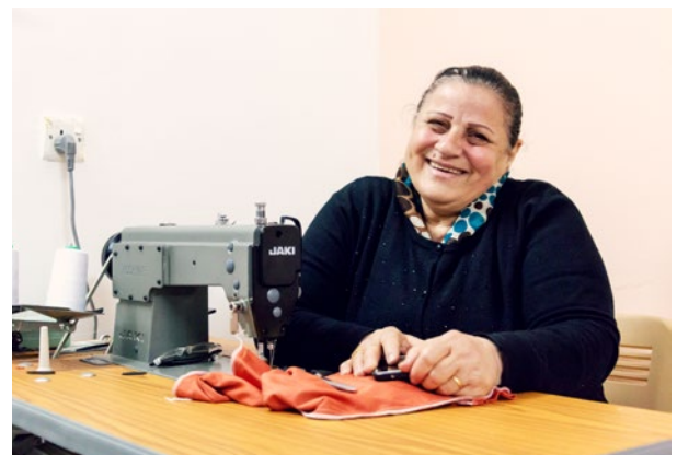
A displaced Christian woman working in The Sewing Shop – an income generating project run by a Syriac Orthodox partner of Open Doors in Erbil, Iraq

in education, healthcare and business management. The need for their contribution to these sectors is likely to remain high in the coming years. But Christians have lost land and property in both countries, which have been confiscated and redistributed. If they are unable to recover these holdings, further emigration will be inevitable. Similarly, Christian facilities such as churches, residences and community halls are being destroyed and confiscated. With fewer resources, Christian humanitarian and social welfare activities will become more difficult to implement.