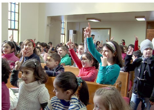
Sunday school for displaced children in Alliance Church, Damascus

Right now the number of out-of-school children is on the rise, especially in Syria where UNICEF estimates that half of all children are not currently going to school. The more the conflict is prolonged, the greater the number of children who will fall behind in school or will have missed too many years to resume their education. This is one reason why Christian